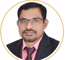
DR ABRAHAM VARGHESE

Keynote Speaker St. Joseph's Institute of Technology