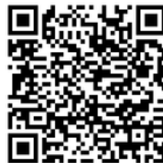
Download Abstract Submission Template