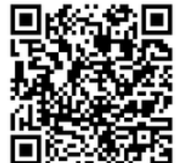
Download Abstract Presentation PPT